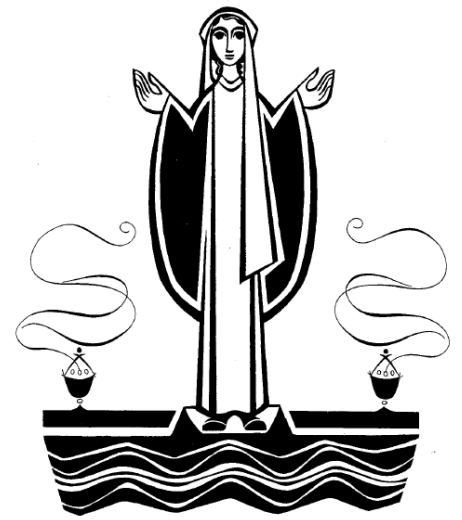
MARY - MODEL OF THE PRAYING CHURCH

May we continue to contemplate the Virgin Mary, who pondered in her heart the mystery of Christ. We know that Mary is present as a mother to us, so shares in the many complicated problems which today beset the lives of individuals, families, parishes, schools and communities. We know that Mary has a heart for the Christian people in our constant struggle between good and evil, to ensure that we do not fall, or, if we have fallen, that we rise again.