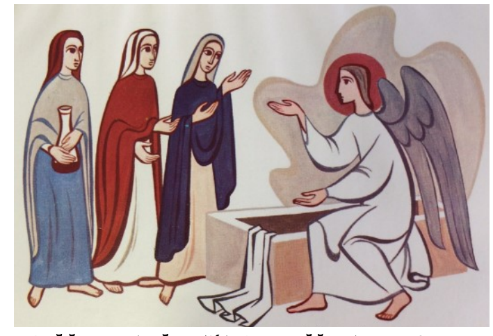
God has raised up His Son, a blessing unto you.

On discovering the empty tomb, the disciples begin to grasp the meaning of Scripture (GOSPEL).